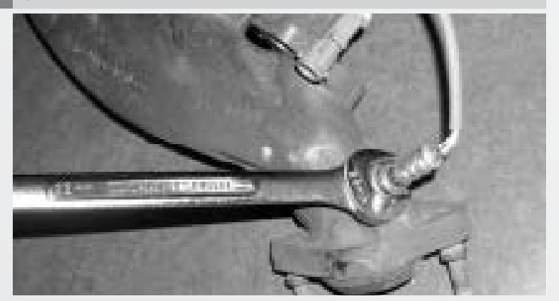
Remove the front driver side oxygen sensor from the manifold.