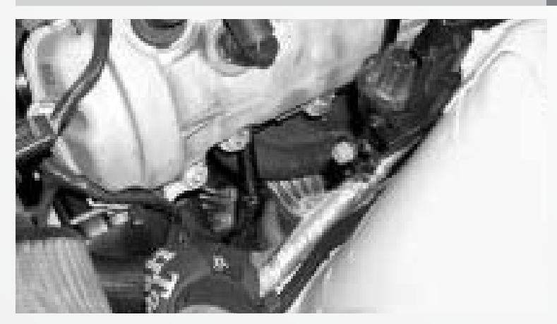
Remove the stock exhaust manifold and gasket. (Some of the manifold bolts are easier to access while working under the hood)