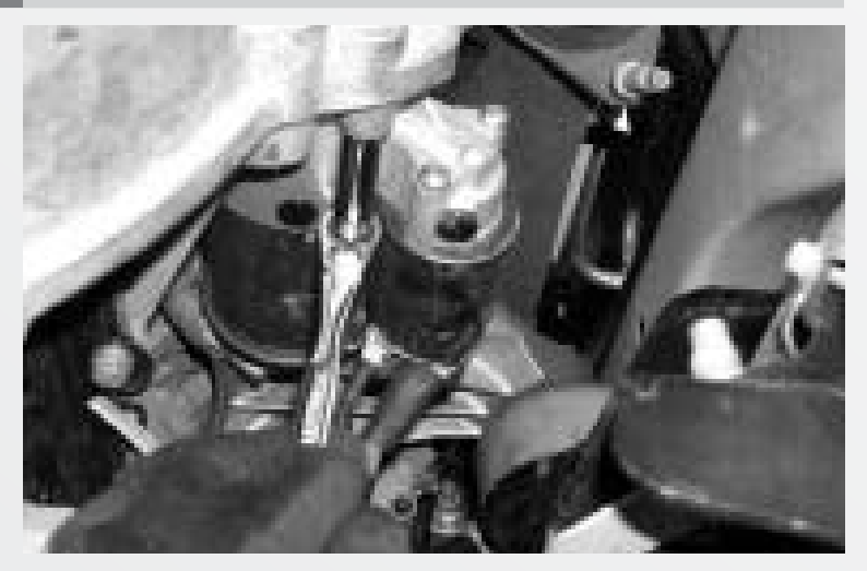
Unbolt and remove the starter from the bell housing.